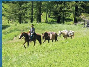
Both boxes and buckets were used to haul dirt