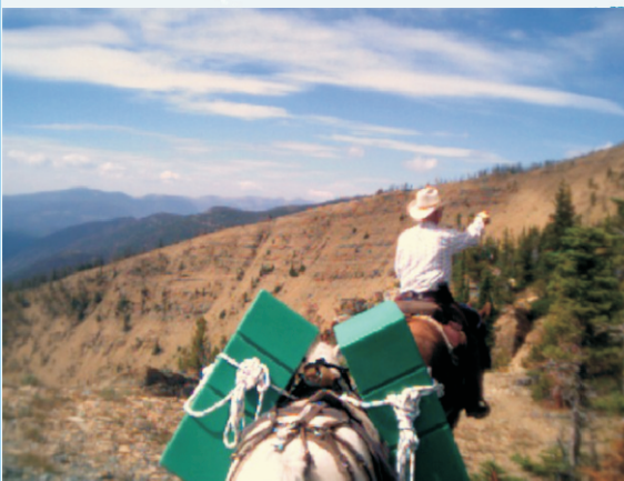
Packing Contineatal Divide Crew