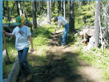
Filling the erosion

The trail was repaired making horse traffic safe. Charlie Russell members receive the National Stewardship Award for their efforts.