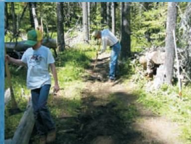
Filling the erosion

The trail was repaired making horse traffic safe. Charlie Russell members receive the National Stewardship Award for their efforts.