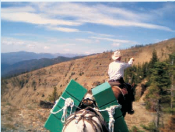
Packing Contineatal Divide Crew