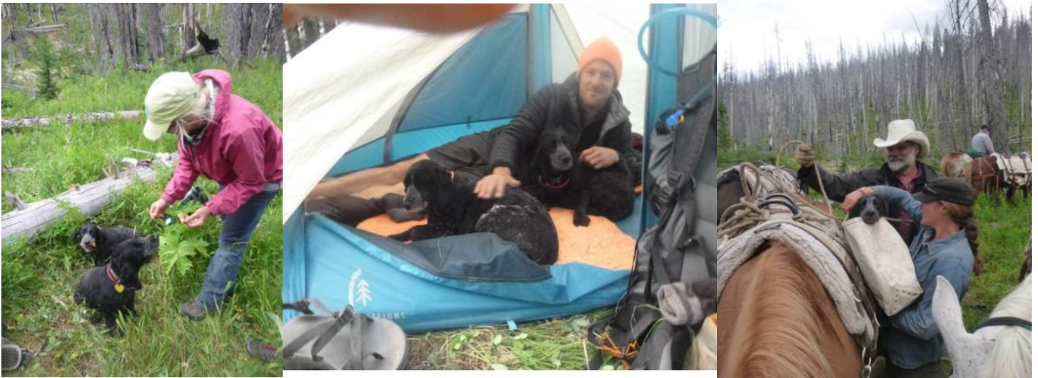
The two dogs Molly and Abbey getting a bit to eat—pard!