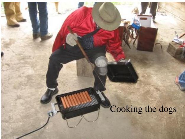
Cooking the dogs