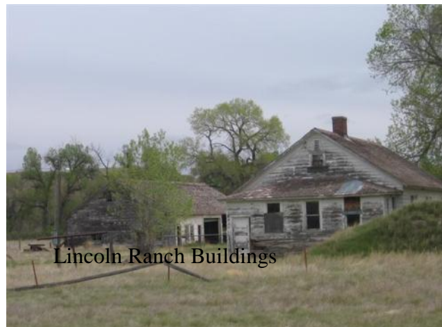
Lincoln Ranch Buildings