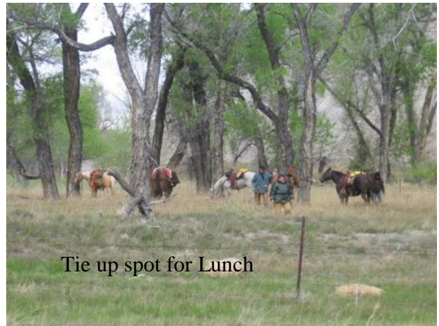
Tie up spot for Lunch