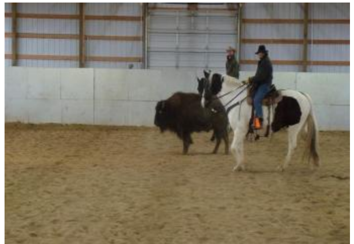
East Slope Members practicing cutting on some of Wylie's Bison