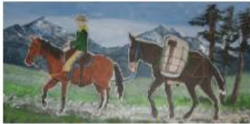
Back Country Horsemen