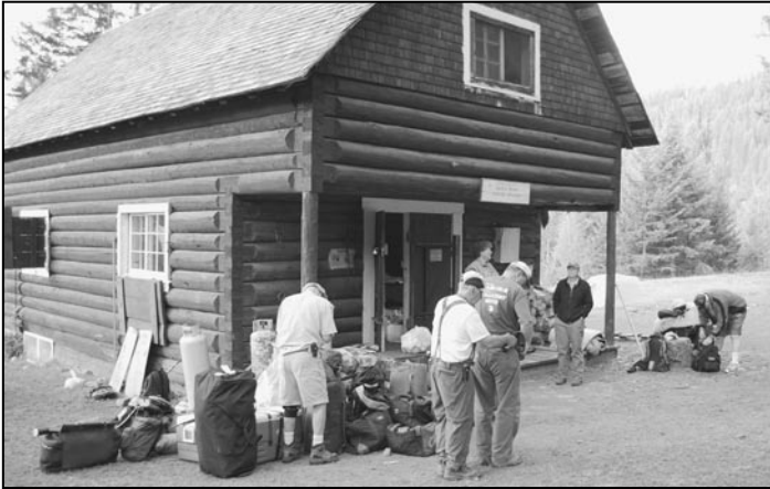
Smokejumpers getting their gear ready before they hike out.

West cross trail for about 1/4 mile, the cabins and the swinging bridge came into view. We thanked Andy for his great trail guiding skills and all were happy to see the cabins before us.