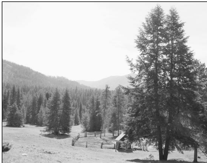
The stock corrals at Black Bear.

Tony's horses were going in "o natural" (shoeless) and did just fine until the trip out, when one of them just refused to go any further. It seems they were about 4 miles from the Meadow Creek Trailhead, so they just had to tie it