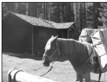
Ron's horse packed standing in front of Spruce Cabin.