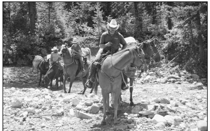
Our group at the tail end of a long line of stock on the ride out.

Everyone helped in mantying up the gear and we were ready to head back to the trailhead at about 11:30am. The most exciting thing that happened on the way back was that we fell in behind two outfitter strings and were the tail end of a 35 animal pack string headed for Meadow Creek. It was a little dusty, but we didn't have to yield the trail to anyone.