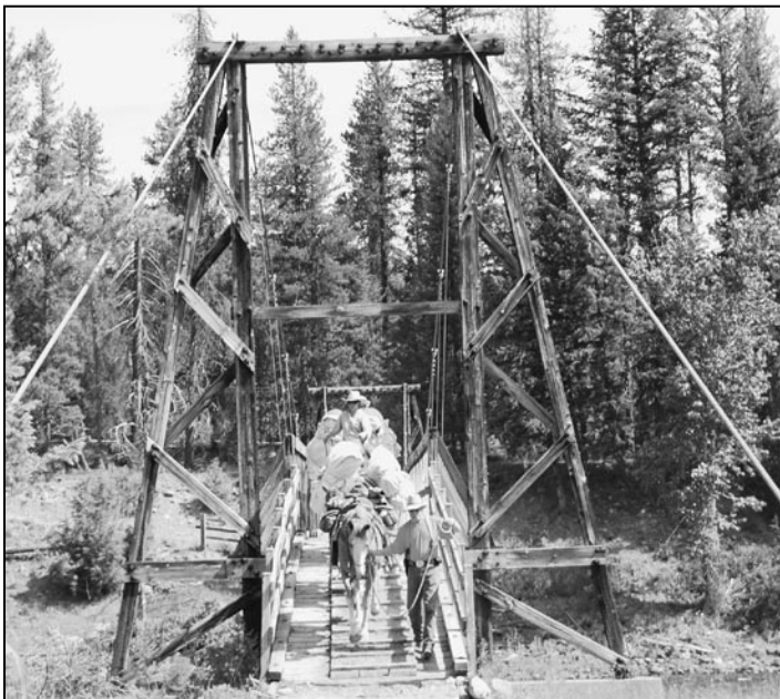
Crossing the swinging bridge.

If any of our members want to have a great experience, they should join us for one of our projects that provide packing support. It is a great ride with only a small amount of work. It is a good way to get some experience in the back country and get some trail miles on those horses. Hope to see new faces on future projects!