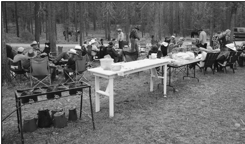
After a great dinner, folks gather at the camp fire to swap stories.