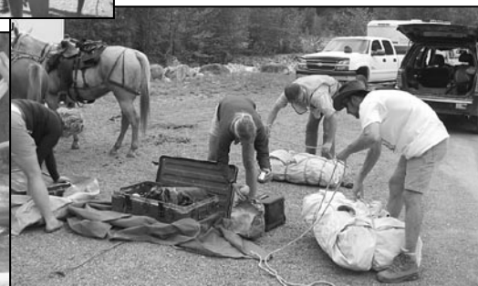
At the trail head unloading all the gear.