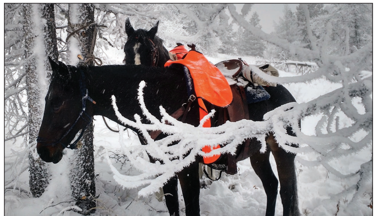
double parked horses, waiting for the elk load