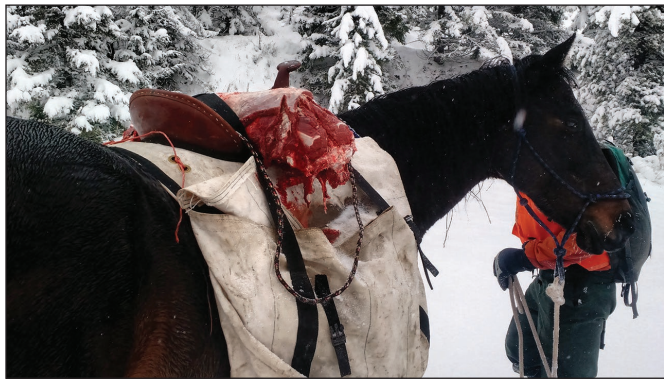
steaks across the saddle bag ( backstraps)