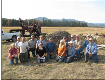
Wire Rollup Volunteers with their Pile of Wire in the Background