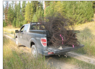
Load number 4 of 5 truck loads of wire!