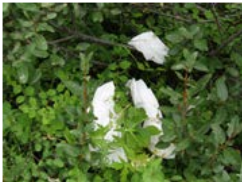
Toilet paper, exposed tree roots from pawing stock, and fire ring with furniture at Schafer horse camp.