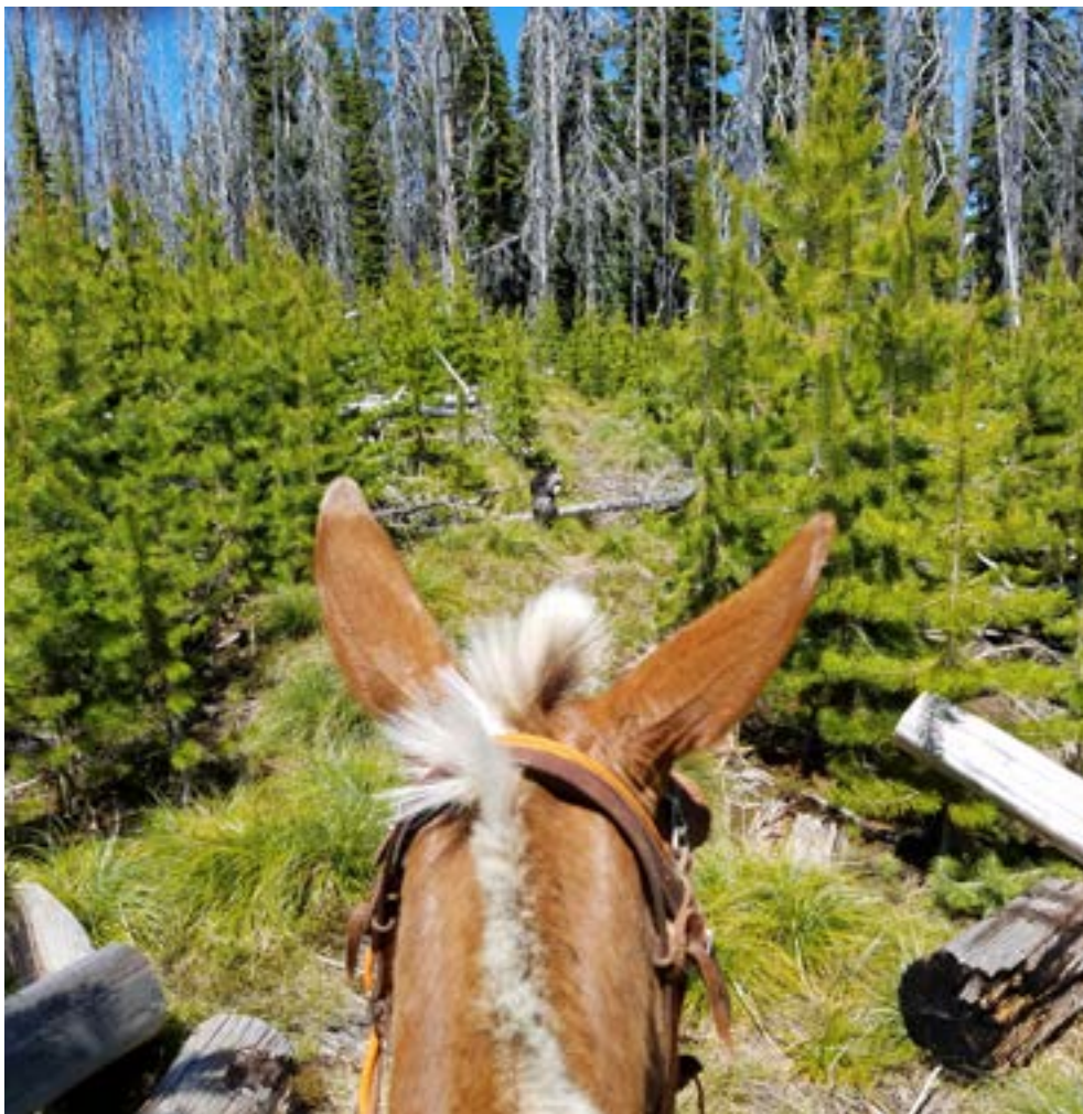
The view from here.

We had just returned from a walk with the dogs (we have four) and I was giving them a treat while taking off leashes. Kahuna flipped his switch and came barreling off the step. The fight was on. My daughter and I tried to separate them, but couldn't keep them apart. Through past experience (I have scars to prove it) I am careful around dogfights, but also hate vet bills, and besides, this could go on until one of them killed the other.