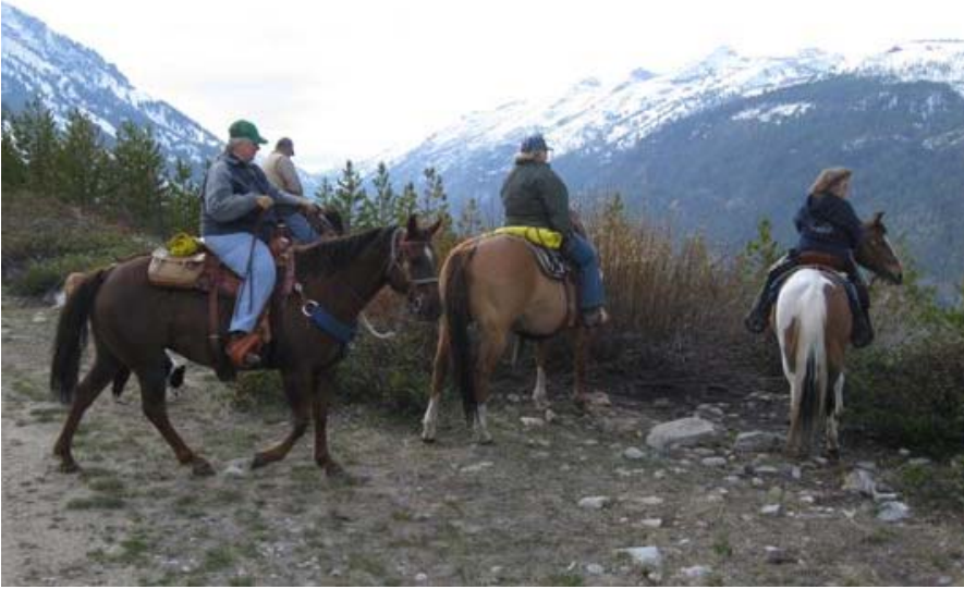
Members at Lake Como trail overlook

The general meeting was held at Lake Como in May – Trail and meeting photos