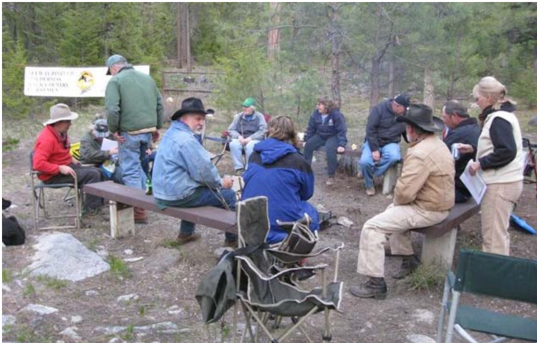
May 2008 General Meeting